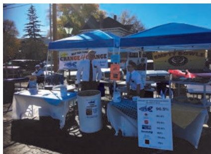
Information booth across from the Nugget