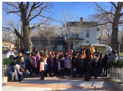
5th Grade students from Bordewich Brey singing Christmas carols at the Share Your Holiday food drive 2017