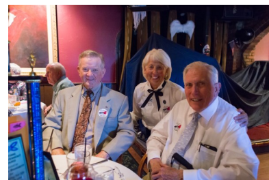
Have A Heart 2017