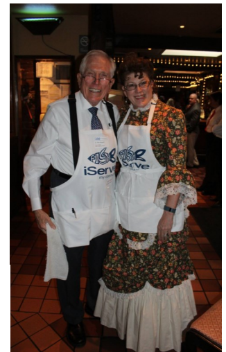
2016 Have a Heart