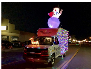
Parade of Lights in Douglas County 2017