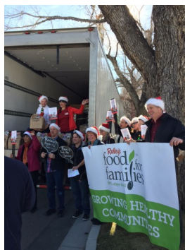
Raley's truck and staff for the Share Your Holiday food drive.