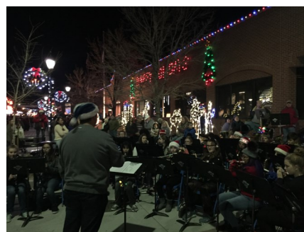
Advanced band from CMS playing at Empty Bowls 2017